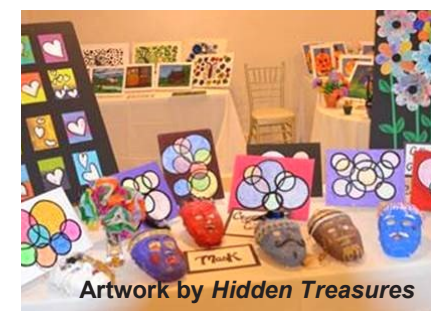
Artwork by Hidden Treasures