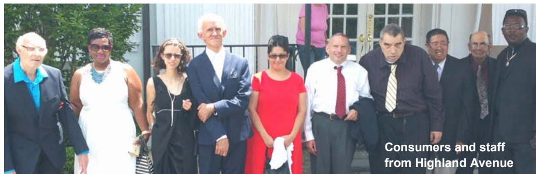
Consumers and staff from Highland Avenue