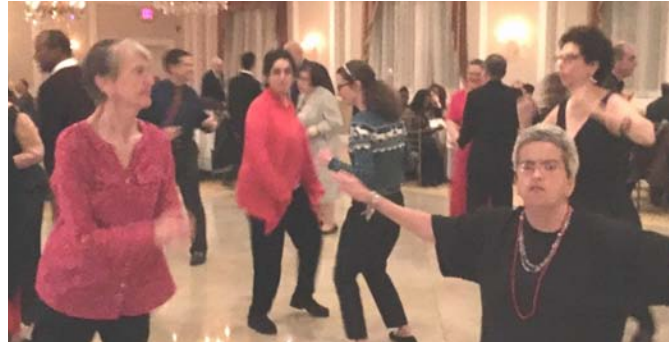
The dance floor was hardly ever empty!