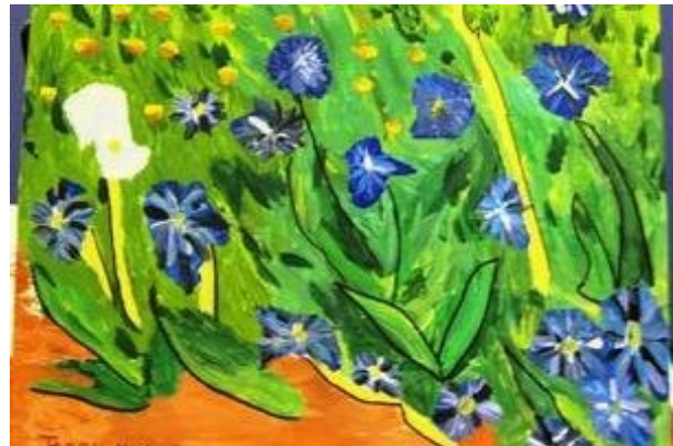
I feel proud and happy when I see a finished art piece - Jimmy