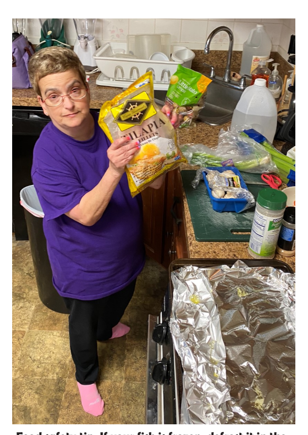
Food safety tip: If your fish is frozen, defrost it in the refrigerator overnight, never on the counter.