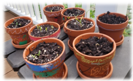
Continued on P. 7

Every month, we plan fun and educational crafts and projects for all the residents at Kitchawan.