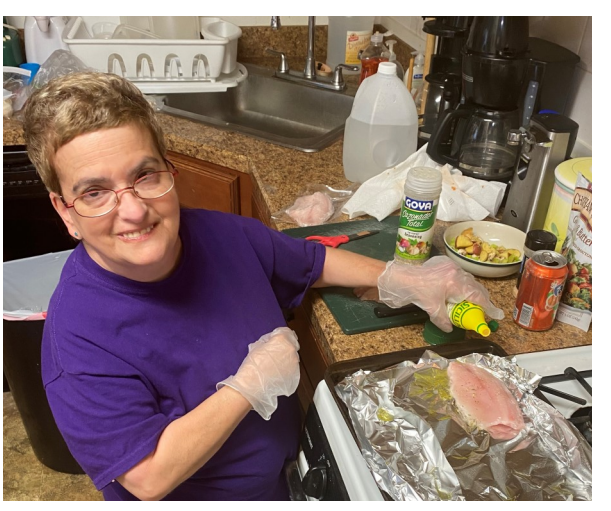
Jenny says to use bottled or fresh lemon juice, "whatever you have on hand."