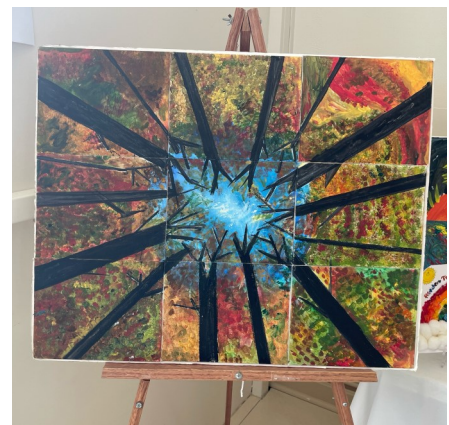
The Gala kicked off with an art show featuring dazzling works created by Hidden Treasures artists.