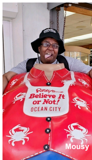
Website coming soon: creativeescapes.art