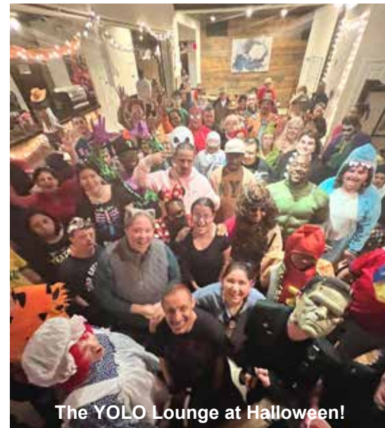
The YOLO Lounge at Halloween!