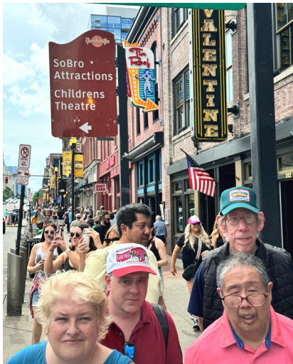
CLCers strolling down the streets of bustling Nashville, Tennessee, known the world over as Music City .