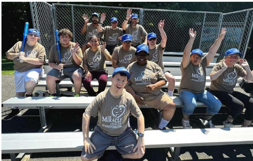
The Cool Cats are members of The Miracle League of Westchester.