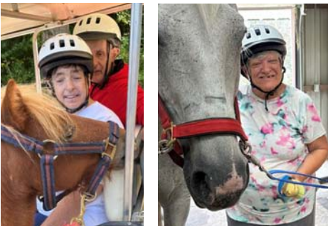
Winslow Therapeutic Center is an agency of CLC Group. Healing with Horses since 1974.